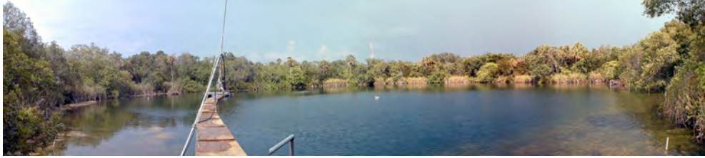
Panoramic view from the west edge across the spring basin