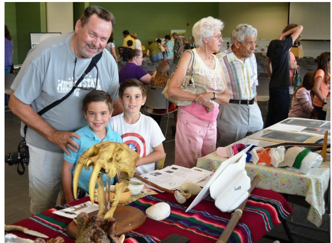
Attendees at AW-LSS learn about the extinct saber cat.

The event is sponsored by the Florida Public Archaeology Network, Friends of Little Salt Spring, and the Warm Mineral Springs/Little Salt Spring Archaeological Society.