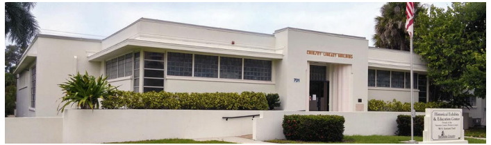
Chidsey Exhibits and Education Center