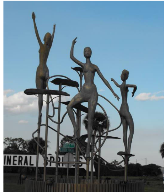
The Historic 1958 Three Graces Sculpture/Fountain

meeting at the Robert L. Anderson Administration Center in the Commission Chambers at 4000 S. Tamiami Trail, Venice, and, Tuesday September 13, at 10:00 AM at the North Port City Commission meeting at City Hall in the Commission Chambers at 4970 City Hall Blvd. Members are encouraged to attend.