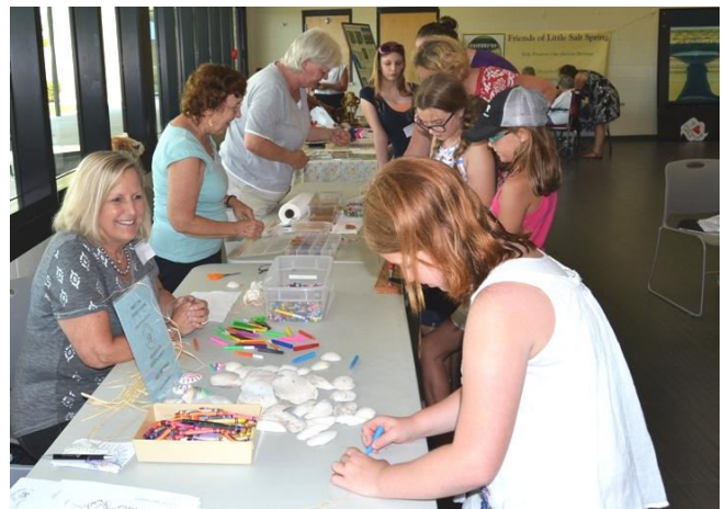
Twine and bracelet making and coloring part of the fun at AW-LSS.